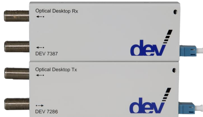
The final product may vary from the above image depending on the options selected.